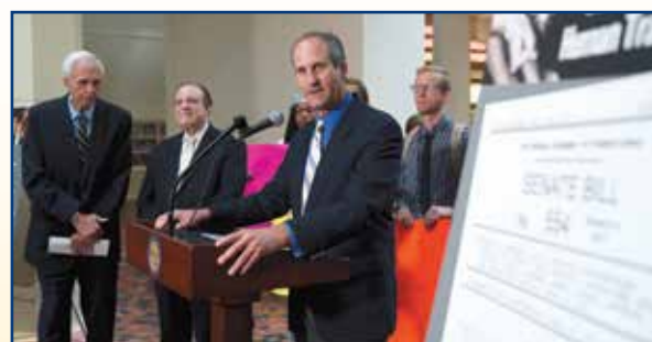
Advocating for action on sex trafficking at a Capitol news conference.

Out of the 199 cases of sexual exploitation reported in 2017 in Pennsylvania, 54 involved minors, according to the National Human Trafficking Hotline.