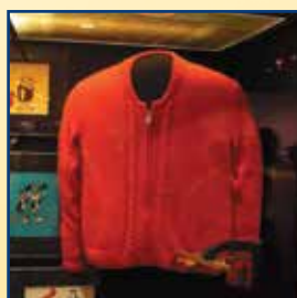
The sweater of Fred Rogers.

Earlier this year I introduced a resolution (H.R. 724) that was adopted unanimously in the House of Representatives. I paid tribute to Fred Rogers, the loveable and entertaining host of the television show Mister Rogers' Neighborhood , who appeared in many homes every weekday afternoon for decades. The resolution commemorated the 50th anniversary of the founding and creation of Mister Rogers' Neighborhood .