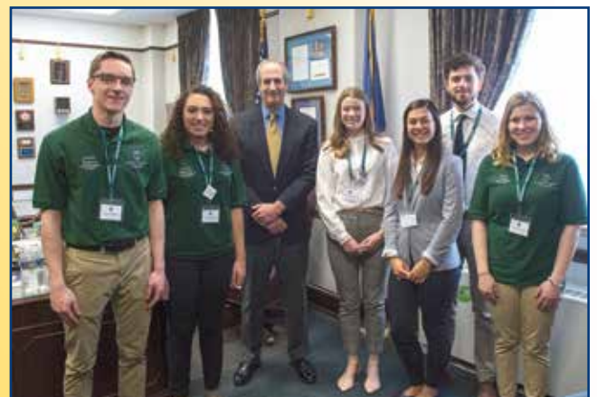
It was a pleasure to welcome students from Saint Vincent College to the Capitol in April.

The Loyalhanna Watershed Association, which integrated Science, Technology, Engineering and Mathematics (STEM) programming at the Watershed Farm in Westmoreland County, has helped educate nearly 500 students in area school districts on the need to be good stewards of our water's resources. As part of their award-winning community outreach program, the Southwestern Pennsylvania Commission Water Resource Center hosted a series of Municipal Stormwater Workshops in nine counties, including Armstrong, Indiana and Westmoreland.